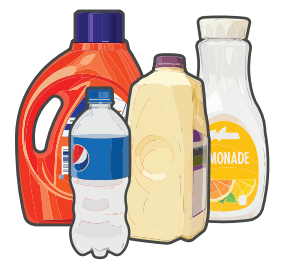
Plastic Bottles. Jars and Jugs (empty and clean)