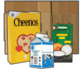
Cardboard and Cartons